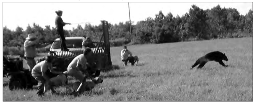
Figure 2. A bear is released from a culvert trap after being tagged and radio-collared.

We estimated distance between consecutive locations to evaluate bear movements relative to treatment and to provide insight into how bears traversed their home range following release. To evaluate space use, we estimated 95% and 50% contours (core area of use) using fixed kernel estimators (Seaman and Powell 1996, Powell et al. 1997) for each bear in the home range, animal movement, and spatial analyst extensions in ArcMap 9.1 (Environmental Systems Research Institute, Redlands, Calif.). To estimate mean distance bears moved from capture sites during the first 24 hours and 2 weeks following release,