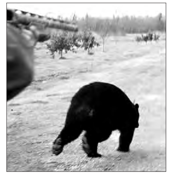
Figure 3 . Shotguns were used to deliver rubber buckshot to a nuisance black bear upon its release from capture as part of an aversive conditioning treatment.

we spatially joined telemetry locations of each bear for each time period to respective capture sites using ArcMap 9.1.