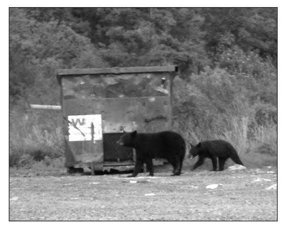
Black bears seek food in a garbage bin.

IN COASTAL LOUISIANA, the threatened aversive conditioning, such as lithium chloride, loud noise, pepper spray, rubber buckshot, and dogs have been used on nuisance black bears by state and federal agencies across North America, but limited research has been conducted testing effectiveness of these methods in deterring nuisance bear behavior (Colvin 1976, Hunt 1984, Gillin et al. 1994, Ternent and Garshelis 1999, Beckmann et al. 2004). Louisiana, much like other states, uses aversive conditioning techniques with limited knowledge of the effectiveness on bear behavior following release and conditioning. The intent of on-site release coupled with aversive conditioning of bears