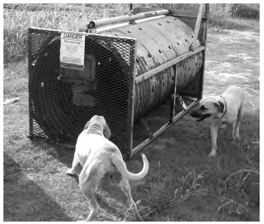
Figure 1 . Culvert traps (pictured) allowed bears to recover from immobilizing injections after capture and tagging.

Using a combination of culvert traps (Figure 1) and modified Aldrich snares (Johnson and Pelton 1980), we captured black bears from April 2005 to February 2006 in areas of St. Mary, Iberia, and Vermilion parishes that reported nuisance